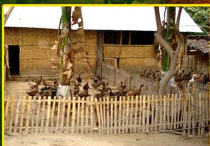
Duck pens after being rebuilt for intensive rearing

The project involves identifying and strengthening institutional context of the research undertaken, with a view to building local production system capacity. Using the local wisdom and the available natural resources research results can be transferred into the field through the use of appropriate information and communication technologies in the forms which are suitable to local community and tradition. Close communication and supervision are required for the development of an effective farmers' group especially in the financial and commercial aspects of the production, and the project has succeeded in convincing traditional farmers to shift into more intensive operation.