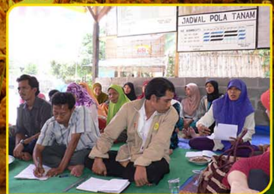
Women farmers actively participated in discussion during training

The success in technical and institutional aspects of the project has prompted the local government to allocate fund for the development of intensive layer duck production system in the regency, by duplicating the model used in the project. The government intervention can certainly stimulate other farmers' groups and accelerate the adoption of the technologies. In the future, the development of technology and marketing information system can further strengthen the duck farming network in the area.